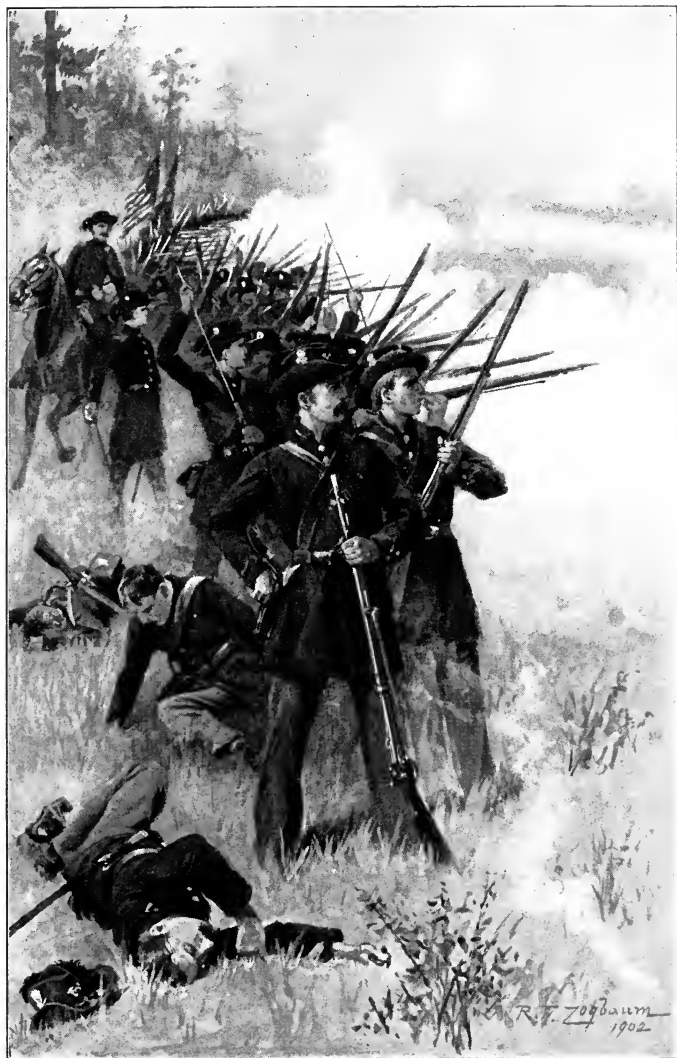
The rifle-butts leap to the shoulders.—Page 222.